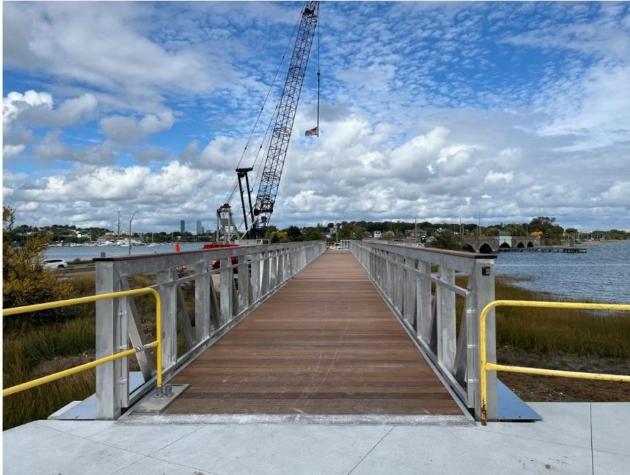
Boardwalk connecting to Morrissey Boulevard, November 2024

Neponset River Greenway extension north from Tenean Beach to Morrissey Boulevard in Dorchester: completion expected soon.